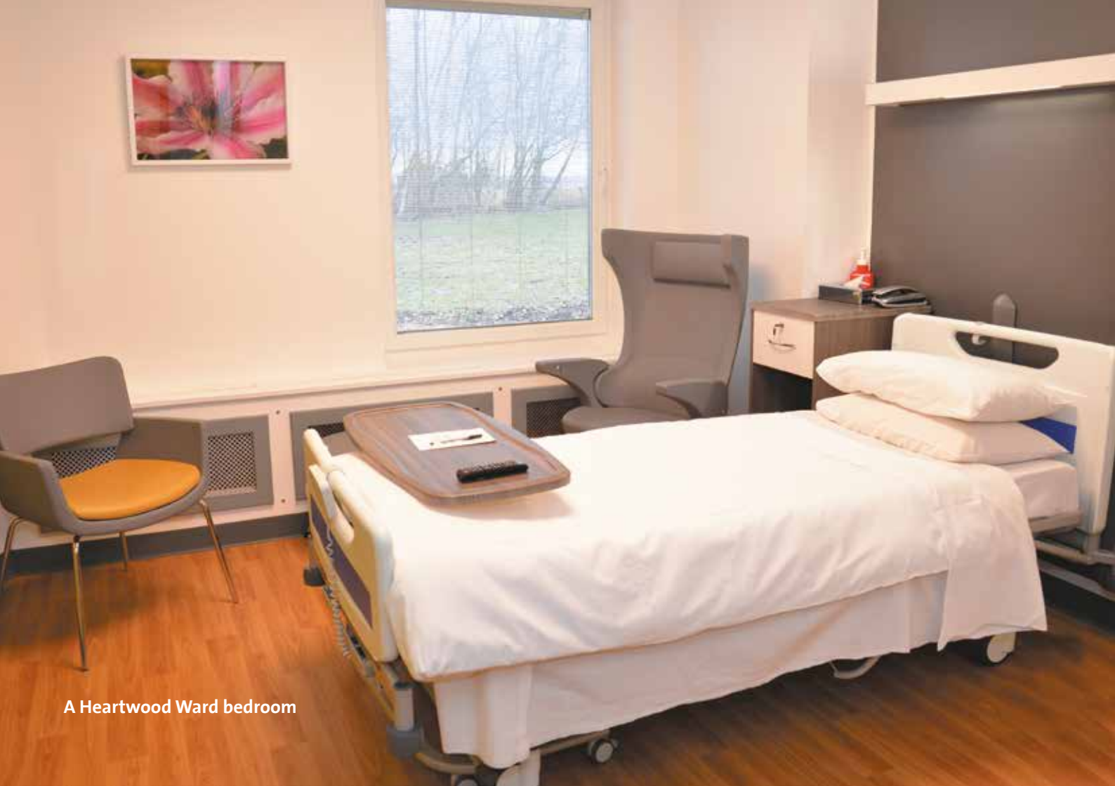
A Heartwood Ward bedroom