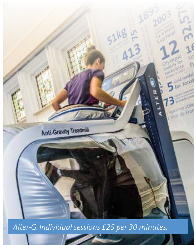
Alter-G. Individual sessions £25 per 30 minutes.

To make an appointment or for information, contact Perform Leeds