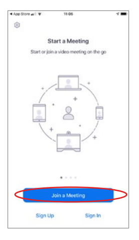
Step 3 With Zoom installed, click the 'Join a meeting' button