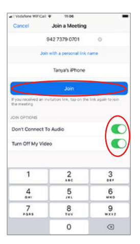
Step 5 Enable your audio and video (if not already enabled) and click the Join button