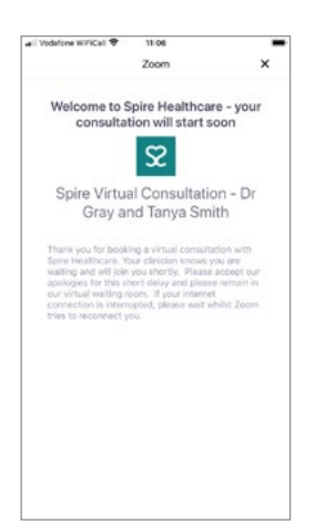
Step 6 You will be placed in the virtual waiting room until it is time for your consultation to begin