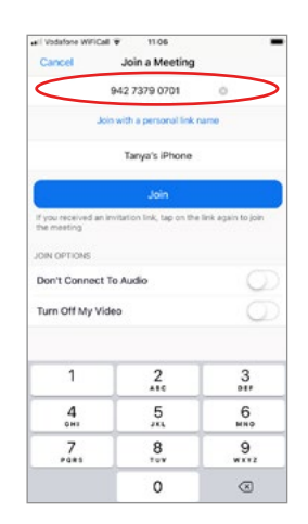
Step 4 Enter the meeting ID that can be found in your email invite