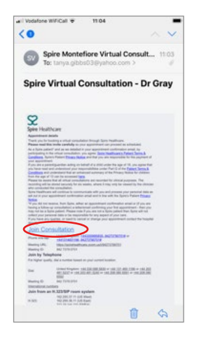
Step 1 Click 'Join Consultation' in your email invite